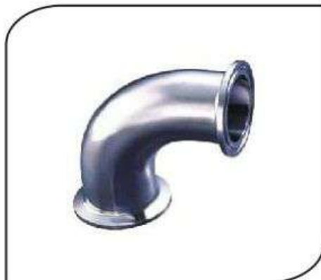
CVMC-032 90° TC BEND