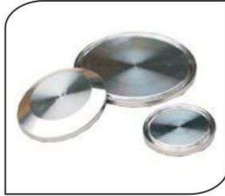
CVMC-023 FERRULE BLIND