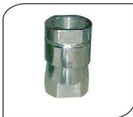
CVMC-079 NRV VERTICAL