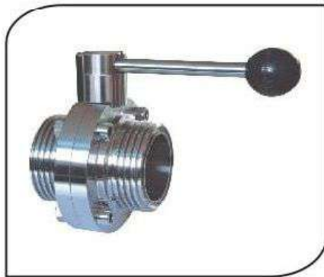
CVMC-002 BUTTERFLY VALVE