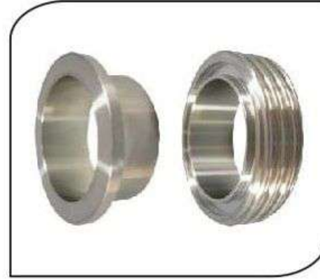
CVMC-024 SMS LINER / PART