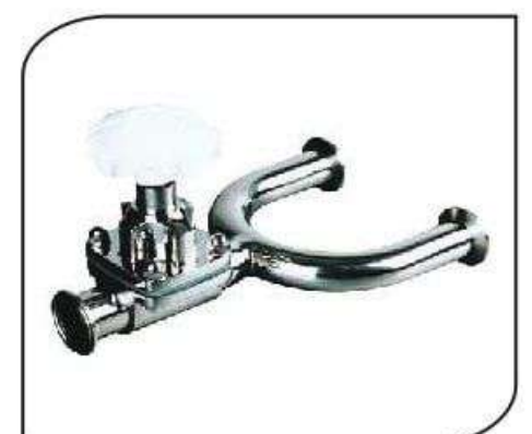
CVMC-070 U-TYPE (3 WAY) DIAPHRAGM VALVE