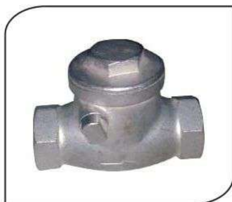
CVMC-077 NRV LIFT TYPE