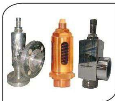
CVMC-043 SAFETY VALVE