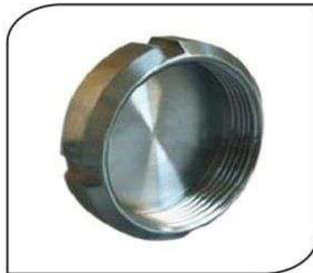
CVMC-028 SMS BLIND NUT