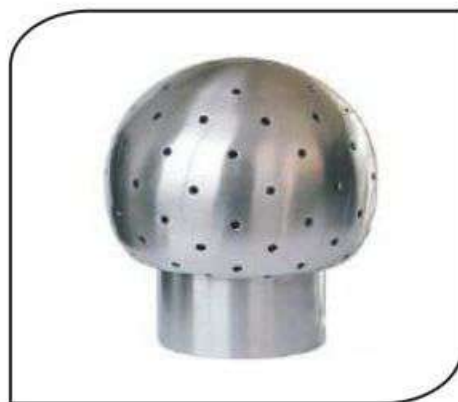
CVMC-084 SPRAY BALL