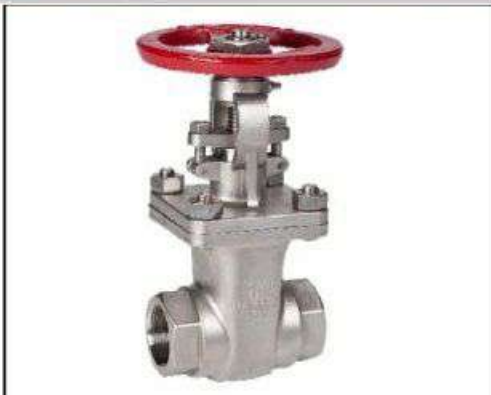
GATE VALVES SIZES 1/2" - 36" PRESSURES 150, 300, 600, 900 & 1500 ENDS FLANGED & BUTTWELD