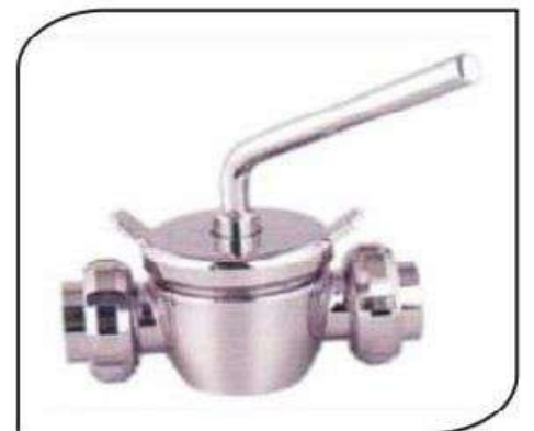
CVMC-010 TWO WAY PLUG VALVE