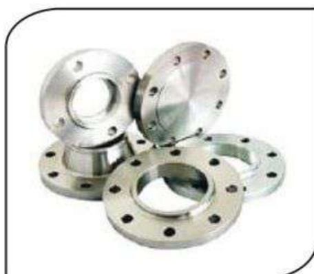
CVMC-042 S.S./C.S. FLANGES