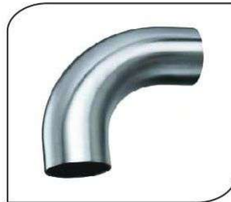
CVMC-029 90° PLAIN BEND