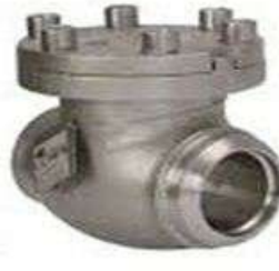
Butt Weld Valve