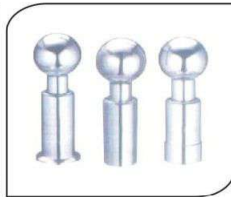
CVMC-014 SPRAY BALL