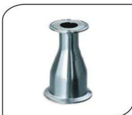
CVMC-067 TC REDUCER