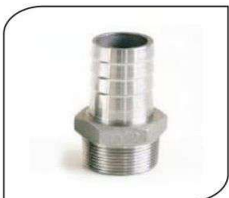
CVMC-041 HOSE NIPPLE