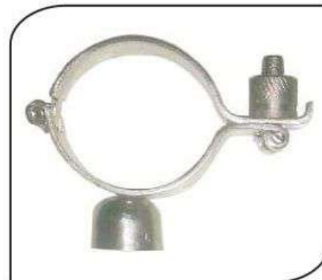
CVMC-034 DAIRY PIPE HOLDER