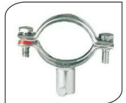
CVMC-035 IMPORTED PIPE HOLDER CLAMP