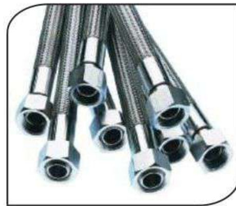
CVMC-090 BSP Flexible Hose