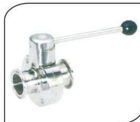
CVMC-064 TC BUTTERFLY VALVE