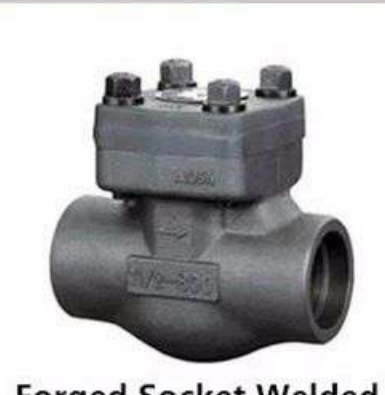
Forged Socket Welded Check Valve