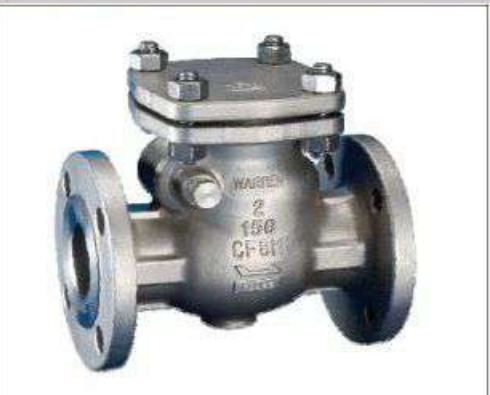
CHECK VALVES SIZES 1/2" - 24" PRESSURES 150, 300, 600, 900 & 1500 ENDS FLANGED & BUTTWELD