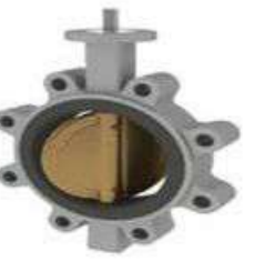
Lug Type Valve