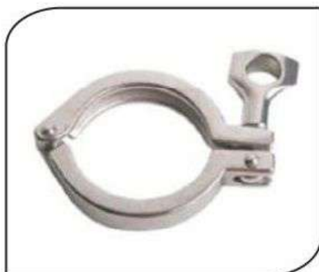
CVMC-017 TC CLAMP