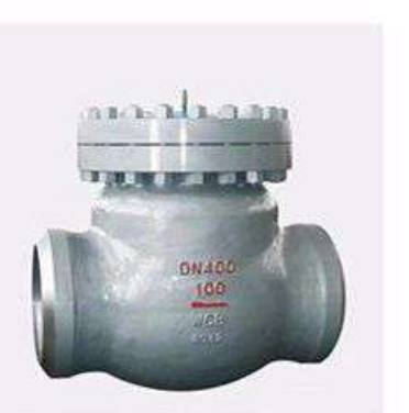
Swing Type Butt Welded End Check Valve