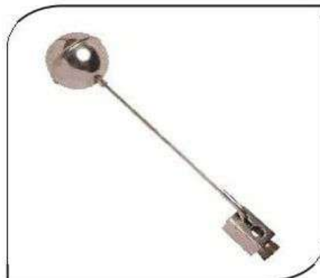
CVMC-038 FLOAT VALVE