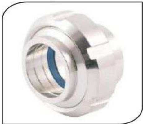
CVMC-026 SMS UNION