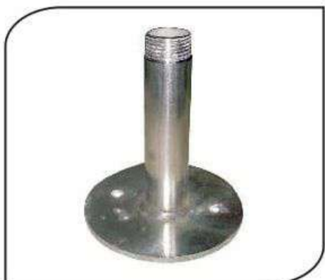
CVMC-061 BSP STAND