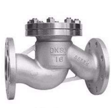
Lift Type Check Valve