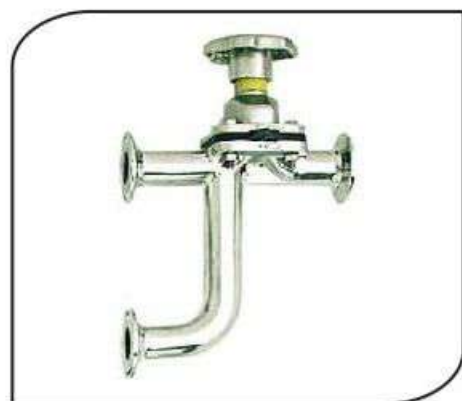
CVMC-071 ZERO DEAD VALVE