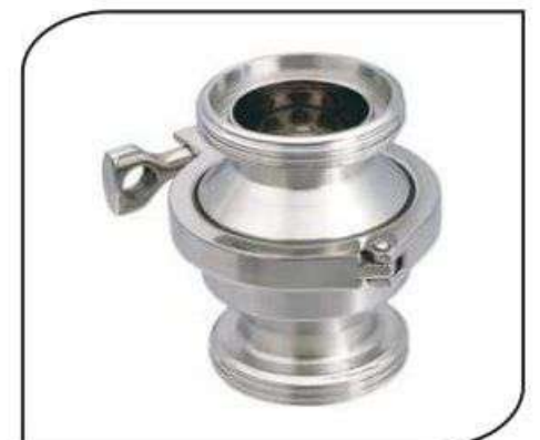
CVMC-065 NON-RETURN VALVE WITH NRV