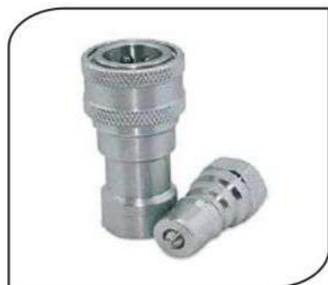
CVMC-091 Double Check Valve QRC