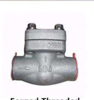
Forged Threaded Check Valve