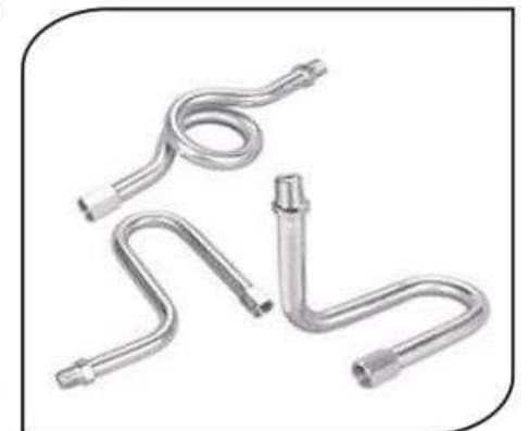
CVMC-040 S.S. SIPHON TUBES