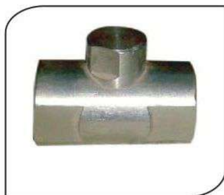
CVMC-078 NRV HORIZONTAL