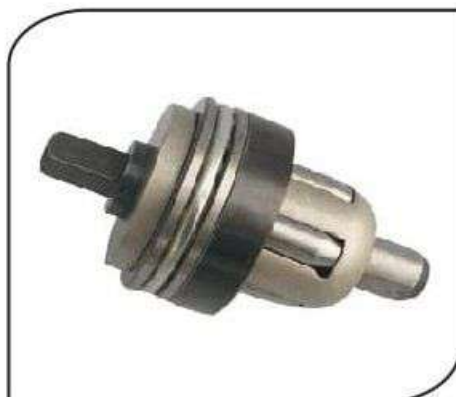
CVMC-057 TUBE EXPANDERS