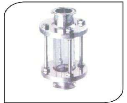
CVMC-015 SIGHT GLASS (T.C END VALVE)