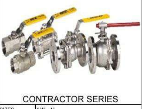
CONTRACTOR SERIES SIZES 1/4" - 4" PRESSURES 150 - 800 - 1000 PORTS FULL & REDUCED ENDS THREADED, FLANGED & SOCKETWELD