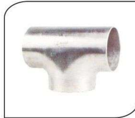
CVMC-054 BUT-WELD TEE