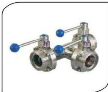
CVMC-007 3 WAY BUTTERFLY VALVE