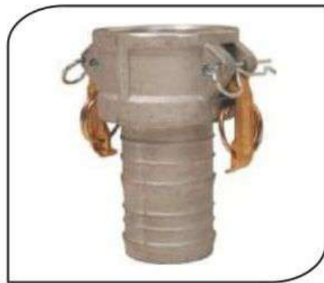
CVMC-088 CAM LOCK COUPLING