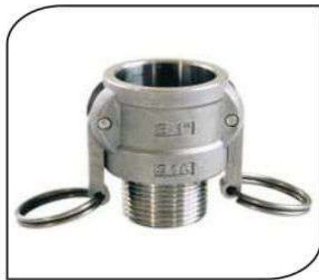
CVMC-087 CAM LOCK & WHITE STAINER