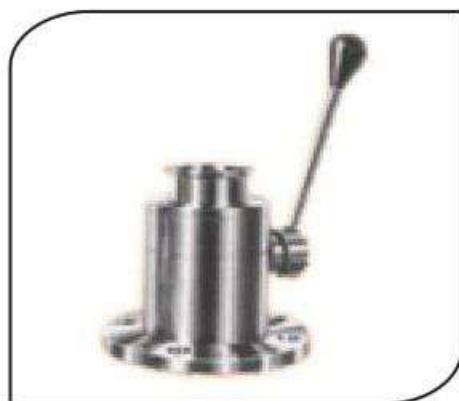
CVMC-072 TC FLUSH BOTTOM VALVE BALL TYPE