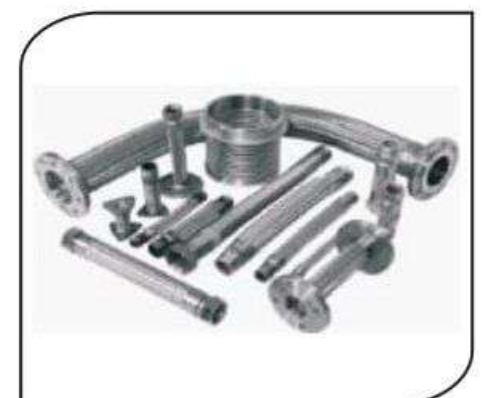
CVMC-045 FLEXIBLE HOSE PIPE