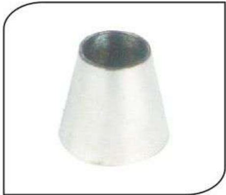
CVMC-051 CON. REDUCER