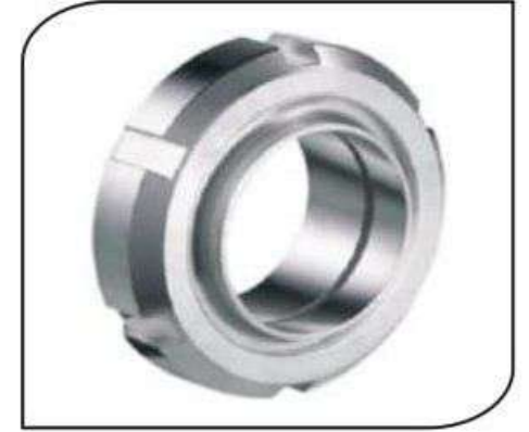
CVMC-025 WELDABLE UNION