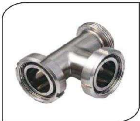
CVMC-036 SMS TEE