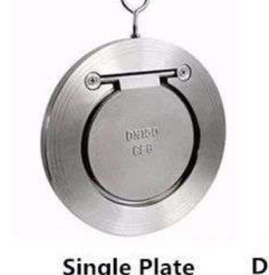
Single Plate Check Valve