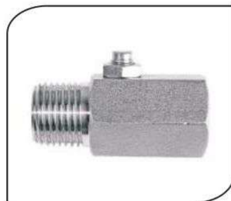
CVMC-095 Pressure Gauge