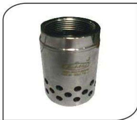
CVMC-082 FOOT VALVE