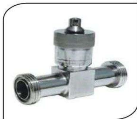
CVMC-083 MICRO VALVE