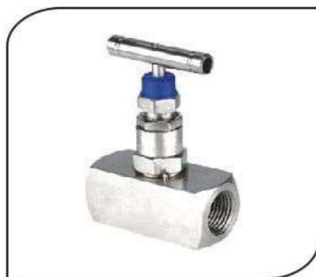
CVMC-074 NEEDLE VALVE UP TO 5000 PSI