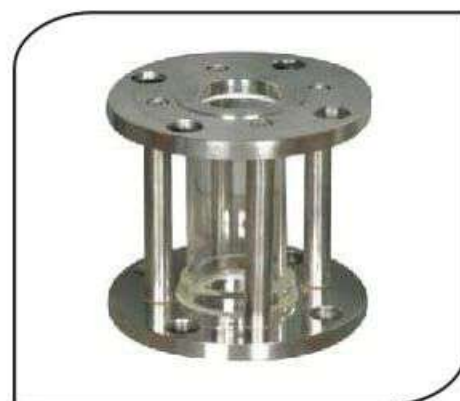
CVMC-080 SIGHT GLASS FLANGED