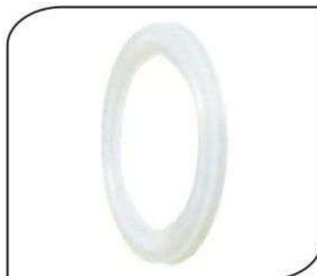
CVMC-058 RUBBER GASKET