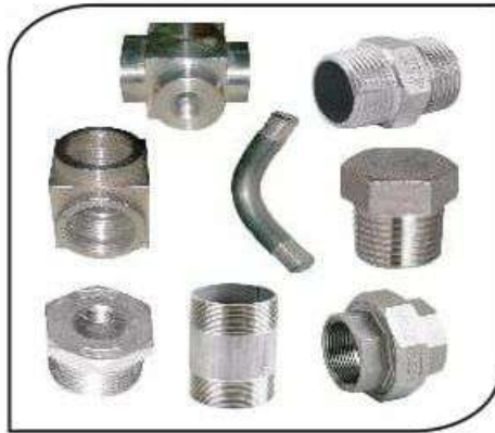
CVMC-047 BAR STOCK FITTING