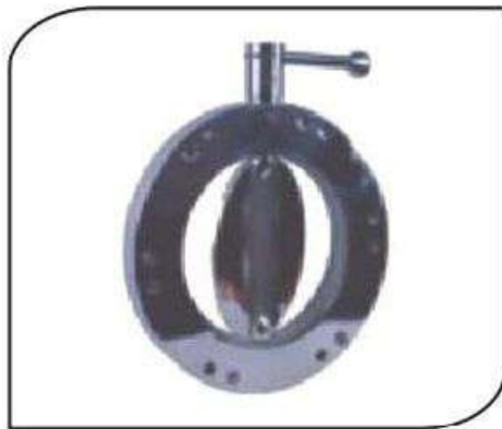
CVMC-012 SANDWICH BUTTERFLY VALVE