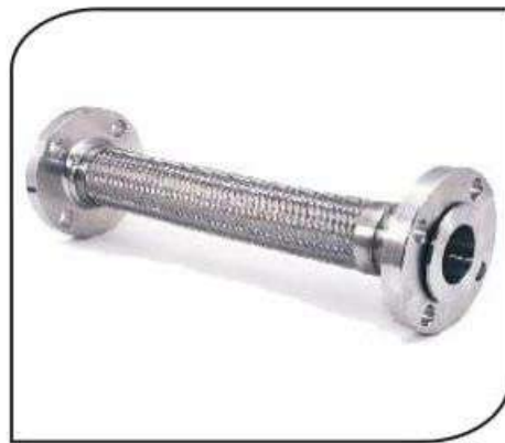
CVMC-089 Flexible Hose with Flange