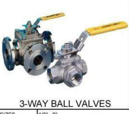
3-WAY BALL VALVES SIZES 1/2" - 6" PRESSURES 150 - 1000 PORTS FULL PORT, L PORT & T PORT ENDS THREADED & FLANGED