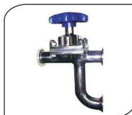
CVMC-069 ZERO DEAD LEG VALVE