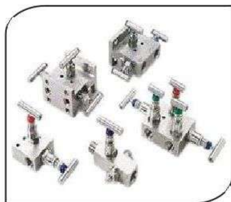
CVMC-073 MANIFOLD VALVE