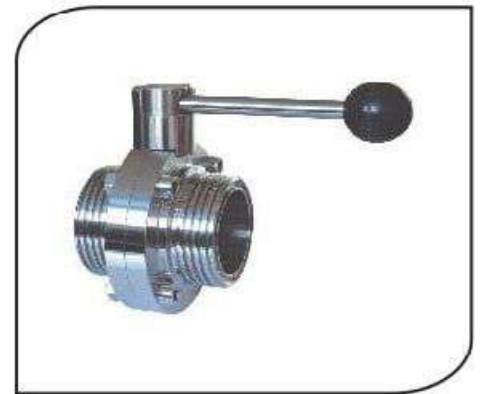
CVMC-005 THREADED BUTTERFLY VALVE