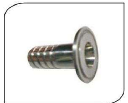
CVMC-020 TC HOSE