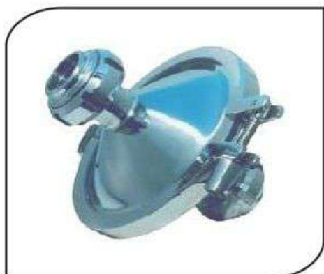
CVMC-016 CONICAL DISK FILTER