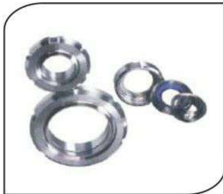
CVMC-027 S.S. UNION