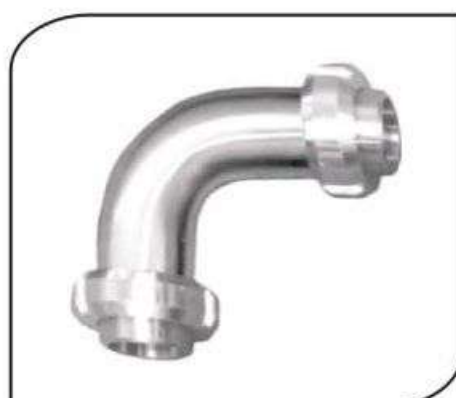
CVMC-068 SMS BEND