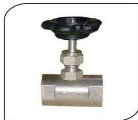
CVMC-075 NEEDLE VALVE UP TO 100 PSI