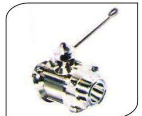
CVMC-060 3PCS BALL VALVE