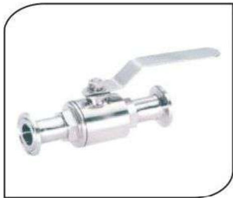
CVMC-011 TC BALL VALVE