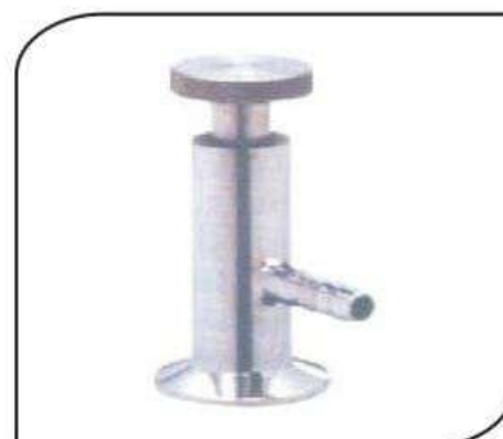
CVMC-044 TC SAMPLE COCK