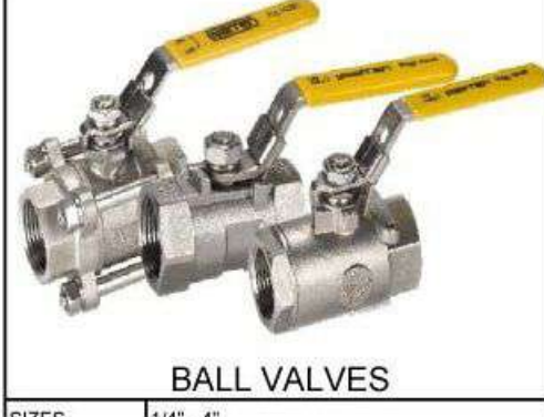
BALL VALVES SIZES 1/4" - 4" PRESSURES 600 - 1000 - 1500 - 2000 PORTS/PCS FULL & REDUCED / 1-PC, 2-PC & 3-PC ENDS THREADED & SOCKETWELD