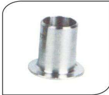
CVMC-053 BUT-WELD STUBEND