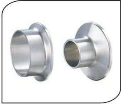
CVMC-021 IMPORTED FERRULE