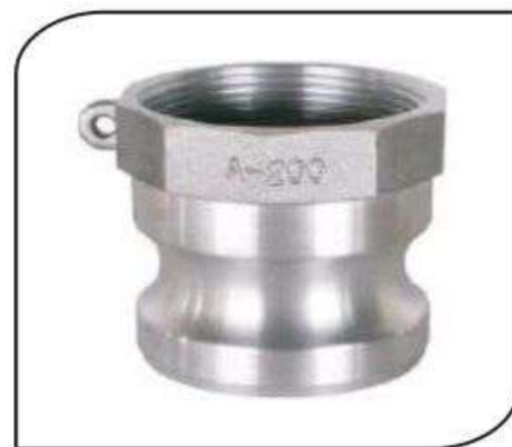
CVMC-085 CAM LOCK COUPLING