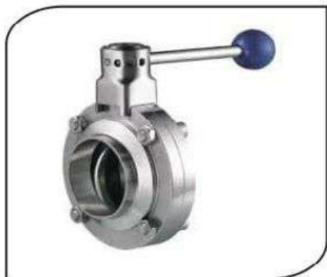
CVMC-006 BUTTERFLY VALVE