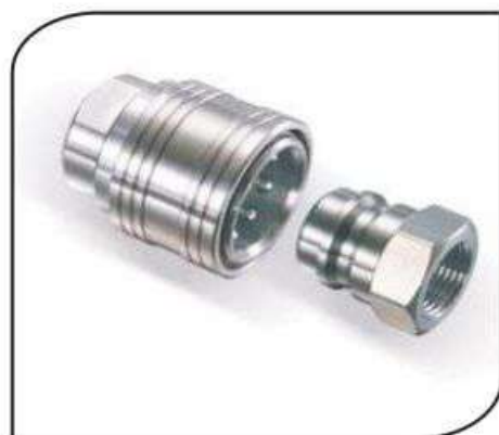
CVMC-093 Straight Through QRC