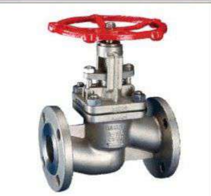
GLOBE VALVES SIZES 1/2" - 12" PRESSURES 150, 300, 600, 900 & 1500 ENDS FLANGED & BUTTWELD