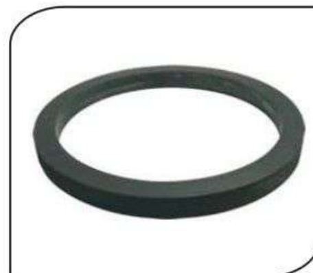
CVMC-059 SMS RING GASKET