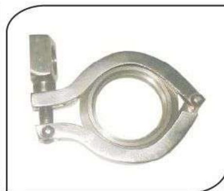
CVMC-019 TRICLOVER CLAMP (UNION) INDIAN SET