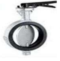
Wafer type Valve