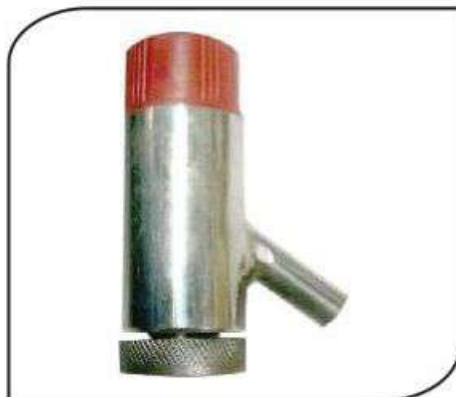
CVMC-037 BSP SAMPLE COCK