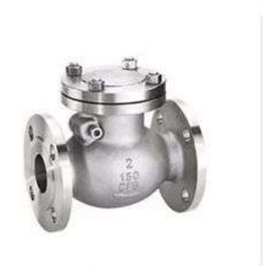
Swing Type Check Valve