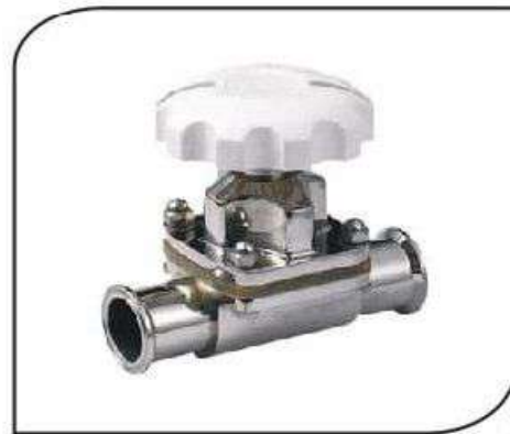
CVMC-003 DIAPHRAGM VALVE