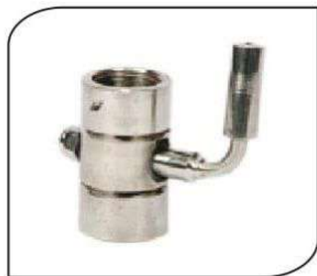
CVMC-081 SYPHONE COCK