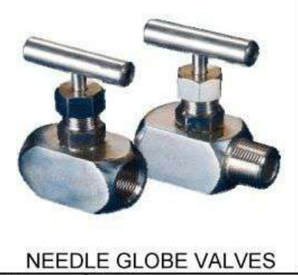
NEEDLE GLOBE VALVES SIZES 1/8" - 1" PRESSURES 6000 & 10000 ENDS THREADED