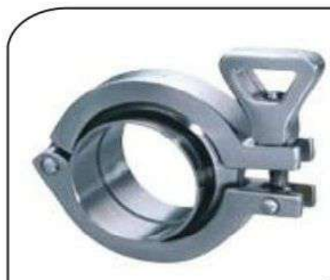
CVMC-018 IMPORTED TRICLOVER CLAMP