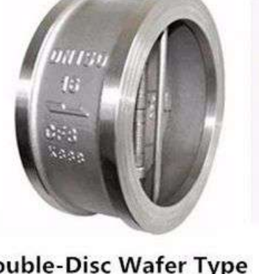
Double-Disc Wafer Type Check Valve