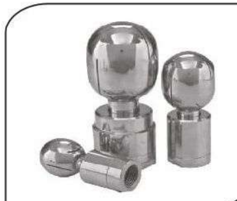
CVMC-013 SPRAY BALL THREADED