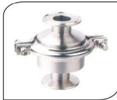
CVMC-004 TC & NRV VALVES