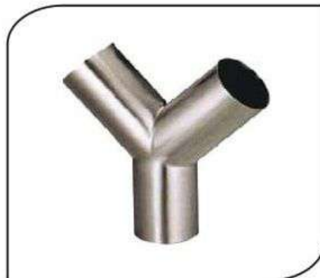
CVMC-033 Y TYPE TEE