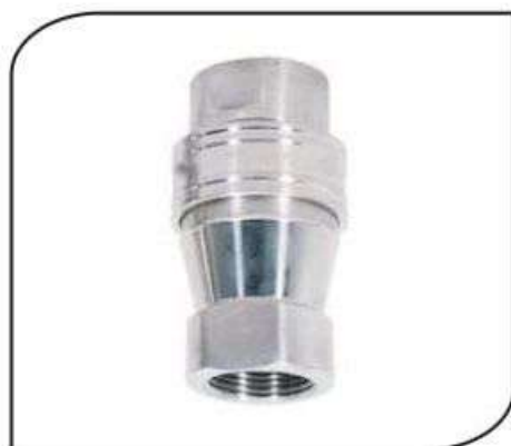
CVMC-092 Single Check Valve QRC