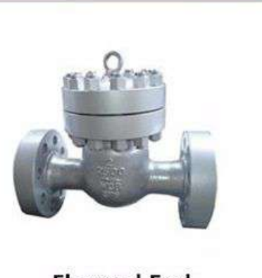
Flanged End Check Valve