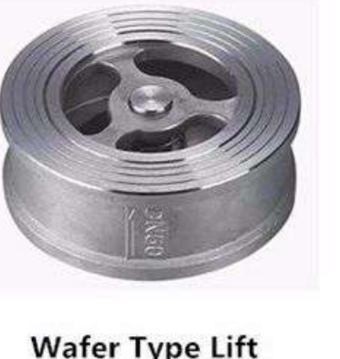
Wafer Type Lift Check Valve