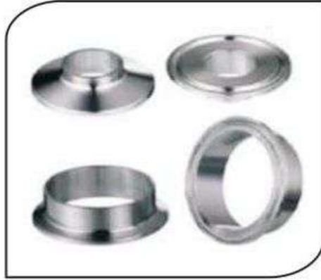
CVMC-022 FERRULE MALE / FEMALE