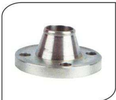
CVMC-056 WELD NECK FLANGE