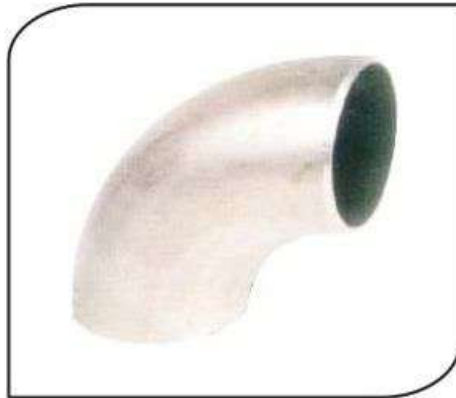
CVMC-052 BUT-WELD BEND