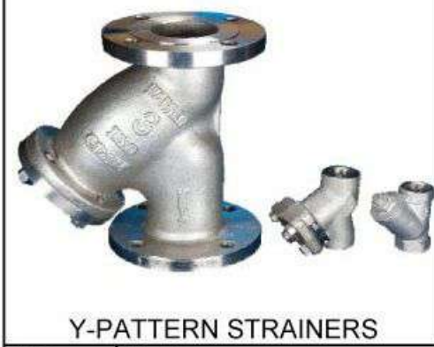
Y-PATTERN STRAINERS SIZES 1/4" - 2" PRESSURES 150, 800 & 800 ENDS THREADED, FLANGED & SOCKETWELD