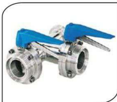
CVMC-062 3 WAY BUTTERFLY VALE