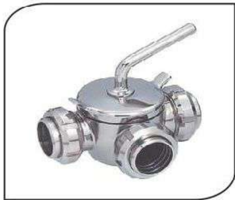
CVMC-001 3WAY PLUG VALVE