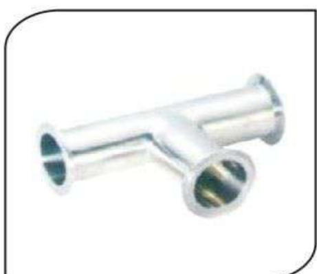
CVMC-066 TC TEE