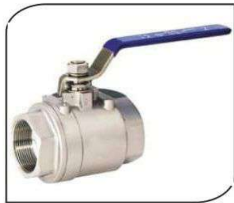
CVMC-086 IC BALL VALVE IMPORTED