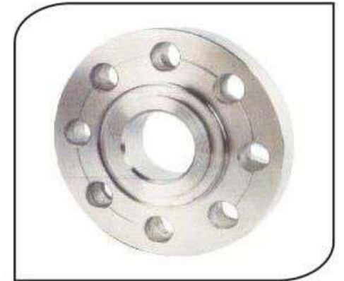
CVMC-055 SLIP ON FLANGE