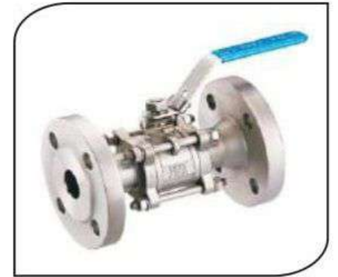
CVMC-050 FLANGE & BALL VALVE