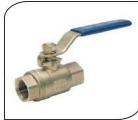
CVMC-049 BSP BALL VALVE