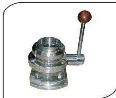
CVMC-008 TANK BUTTERFLY VALVE