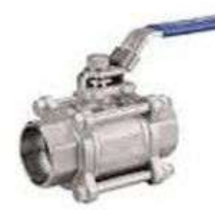
Socket Weld Valve