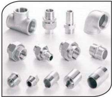
CVMC-046 IC FITTING