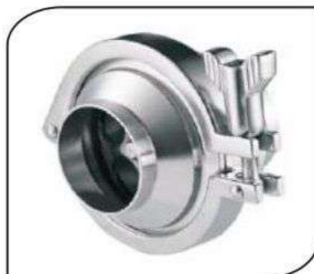
CVMC-063 WELDABLE NRV VALVE