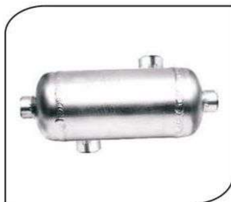
CVMC-094 Flow Control Valve