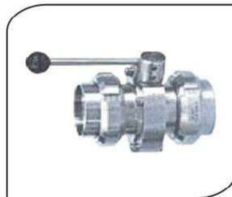
CVMC-009 BUTTERFLY VALVE WITH SMS UNION